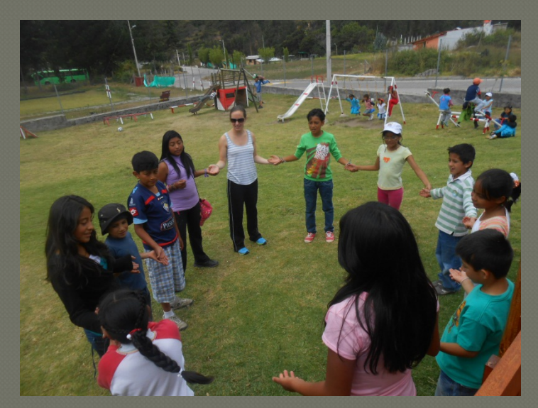
A daily dose of "crocodile moray".