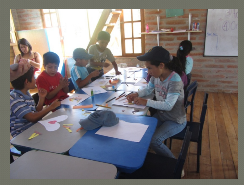
Students working on various art projects from a "holidays around the world" lesson.