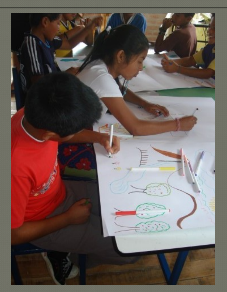
Children work on an environmental awareness campaign for their community.