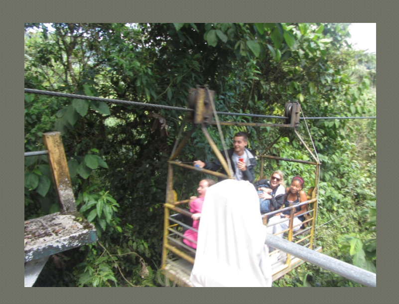
Our transport across the rainforest.