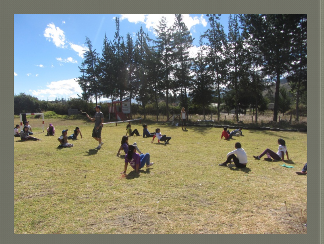
A game of "crab football"