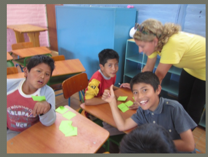
Lumbiseños buying and selling in English