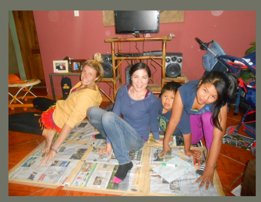
Spending time with your host family. We made our own Twister!

✓ Grow to love a community that is welcoming and appreciative of our service and will teach us more than we ever anticipated.