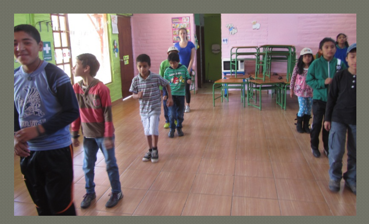
Students learning merengue.