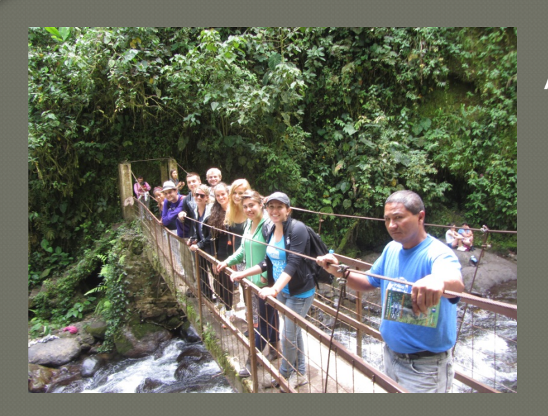
A guided hike in Mindo.