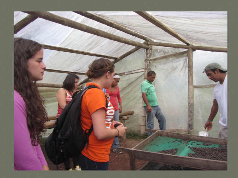
Learning about the chocolate making process.